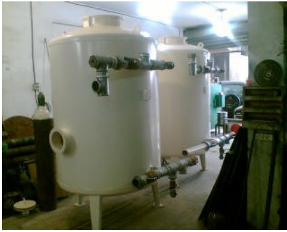
Reverse osmosis plants Skid-mounted with all pre-treatment & post-treatment, and controls.

Akiki Engineering Est. (AEE) started in 1995 as experts and contractors in: