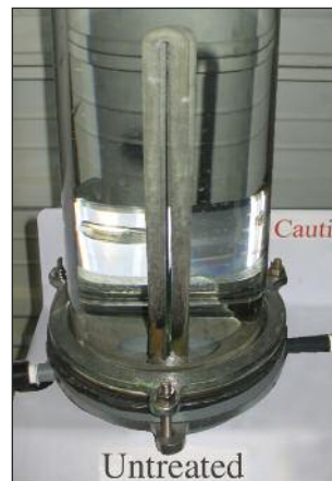
Scale Build-Up (In untreated water).

Photos (below) show scale formation in untreated water and no scale in the E-Treat ® treated water.