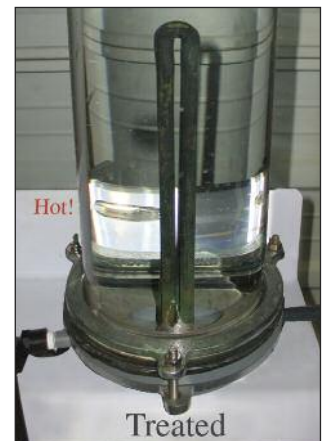
No Scale! (With E-Treat ® ).