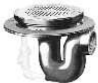
Z-300 Thoroflush Drain

Automobile parking area Basement and subterranean areas Boiler house and Maintenance areas Clinical, Surgical, Detention Areas Entrances and Concourses Finished area/gutter Finished interior floor areas adjustable Food preparation areas Garage, Hangar, and Service areas Volatile liquid interceptors Indirect waste area (condensate & drip) Industrial areas – Vertical adjustment Extra heavy duty Heavy duty Medium duty Traps and backwater valves Planting area Prison cell (multi-purpose) roadways Waste disposal areas