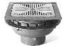
Z-154 Pram Deck Drain