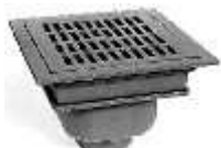
Z-662 Extra Heavy Duty Trench Drain