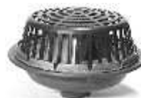
Z-105 Control Flo Floor Drain