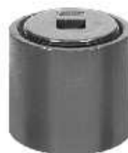
Z-1440 Floor cleanout with countersunk plug