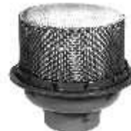
Z-348 Dome Type Planting Area Drain