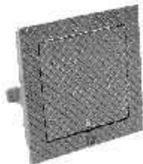
Z-1461 Cast Iron access panel