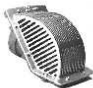
Z-160 Scupper Drain