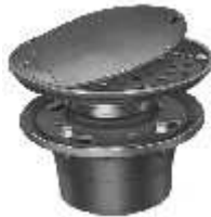
Z-315 Vandal Proof Access Drain