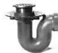
Z-453 Deep Seal Trap With 'B' Strainer