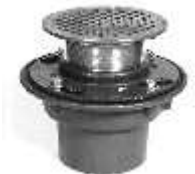
Z-415 Body Assembly with 'T' Strainer