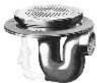
Z-300 Thoroflush Drain