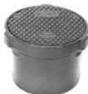
Z-1402 Non-adjustable floor cleanout