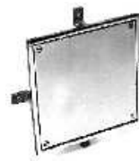
Z-1460 Nickel Bronze access cover