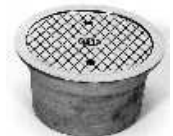
Z-1456 Deck cleanout