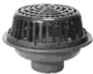
Z-100 Main Roof Drain