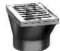
Z-572 Gutter Drain