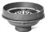
Z-108 Deck Drain