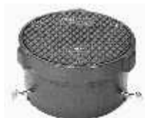
Z-1404 Floor access housing