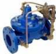
Pilot Control Valves