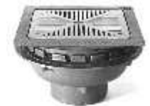
Z-154 Pram Deck Drain