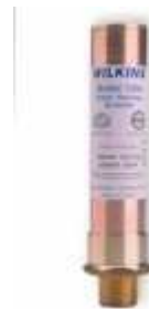
Water Hammer Arrestors