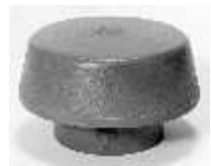
Z-193 Vandal Proof Hooded Vent Cap