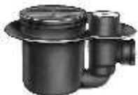
Z-548 Heavy Duty Drain with Integral Trap & Cleanout