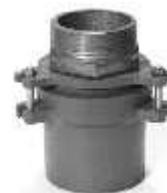
Z-190 Vertical Expansion Joint