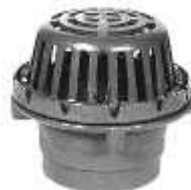
Z-125 Roof Drain Low Silhouette Dome