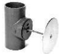
Z-1446 Wall cleanout with Access cover