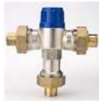
Aqua-Gard Thermostatic Mixing Valves