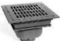
Z-662 Extra Heavy Duty Trench Drain