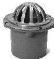
Z-181 Cornicle Drain