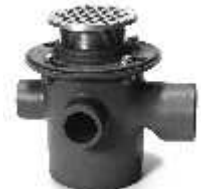
Z-356 Multi-inlet Adjustable Floor Drain