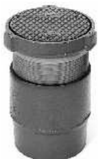
Z-1400 Adjustable floor cleanout