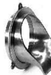
Z-199 Downspout Nozzle