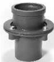
Z-195 Vent Stack Flushing Sleeve