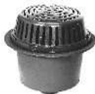
Z-104 Deep Sump Roof Drain