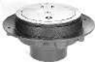
Z-529 Solid Hinged Light Duty Drain