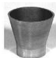
Z-328 Funnel Converting Assembly