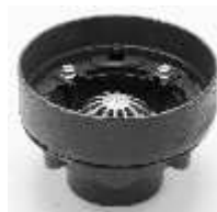
Z-127 Deck Receptor Drain