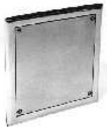
Z-1462 Secured wall access panel

Concealed drainage lines Finished wall areas Access covers and boxes Air inlets General purpose